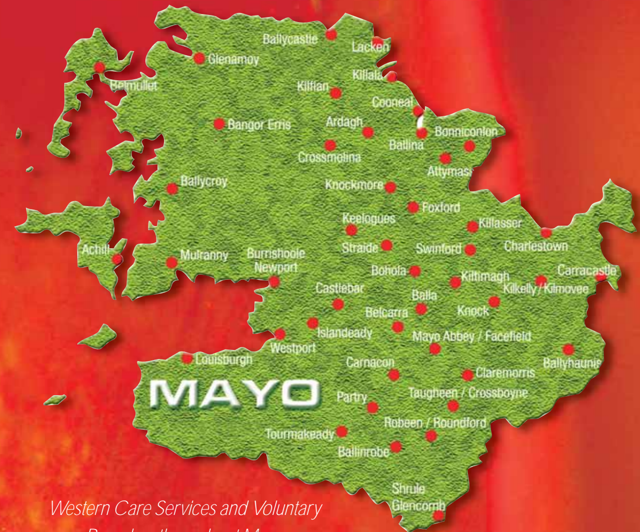
Western Care Services and Voluntary Branches throughout Mayo 1966 - 2008